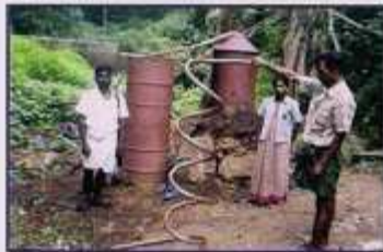
Lemon Grass Boiler Unit

(3) EDP (Environment development programme) in that mainly tree planting, National environment campaign (NEAC), Biodiversity conservation and sustainable agriculture programme.