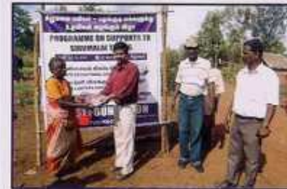
Solar Light Provision

ACHIEVED : 155 families obtained community certificate, 55 got ID card from Tribe welfare board, 55 children under education support, 50 families got MFP rights, 122 children supported by crèches, 50 families retrieved from caves and rehabilitated, 155 families have been provided by solar lights, 2 income generation units by Lemon Grass Oil production to 10 trine families and 25 tribe women are empowered in skill training